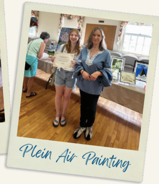
Plein Air Painting